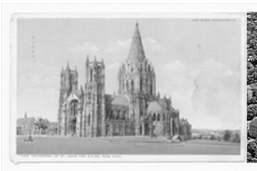
Cathedral of Saint John the Divine, New York City, New York