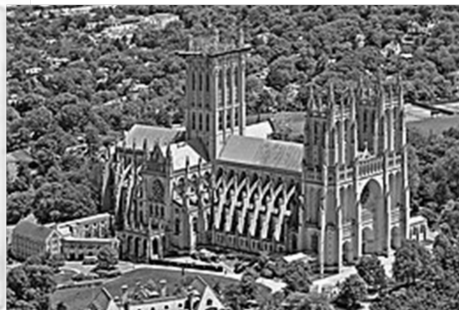
National Cathedral, Washington, D.C.